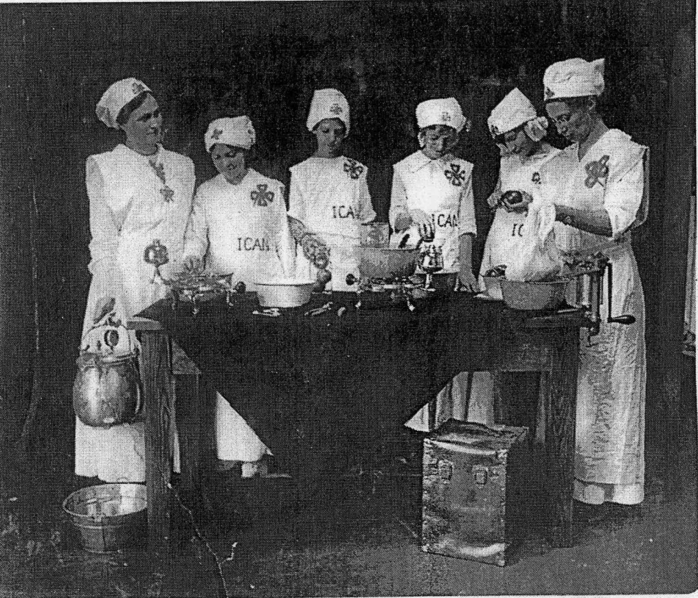
A canning club instructor demonstrating cold-pack canning to the local team and leader. Notice the canning club aprons. (1916)