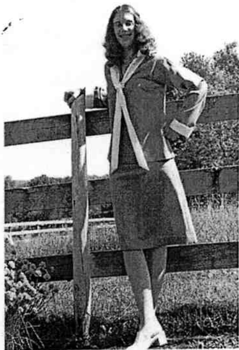
1920's National 4-H Club Camp