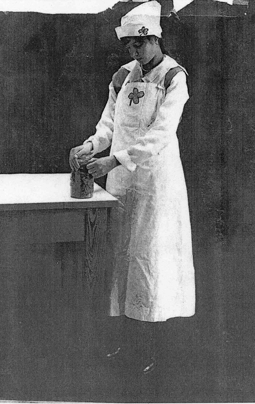
A garden and canning club girl in apron and cap used by members of the demonstration teams.