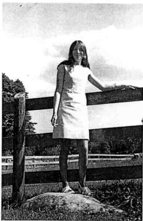
1968 - 1972 National 4-H Club Camp